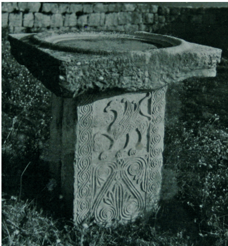
Fig. 4 A Photograph of the Parapet Slabs as the Bases of the Stone Table, taken in the Church of St. Stephen in Sušćeapan (Miodrag Marković, 2017)

are “curves with palmettes, similar to Italian inlays”. 45 After the reconstruction of the church in 1898, parapet slabs were used as the bases of the stone table located in the churchyard (Fig. 4). 46