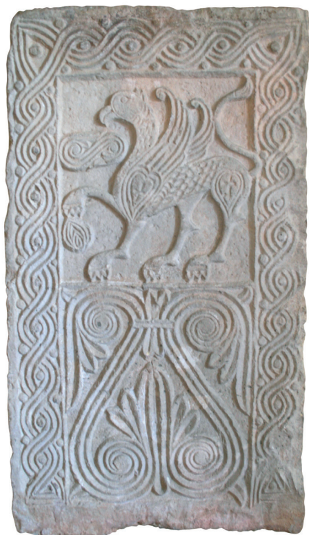
Fig. 5 The Stone Parapet Slabs in the Nave Today

Apart from the parapet slabs, fragments of plastic with floral motifs and a damaged capital were found, which together formed a former stone iconostasis. 47 In the wake of the modern renovation of the church, stone parapet slabs were built into the inner side walls of the nave, in its Northern and Southern sides, where they are still located today (Figs. 5, 6). 48