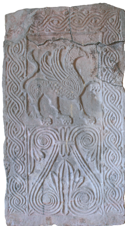
Fig. 6 The Stone Parapet Slabs in the Nave Today