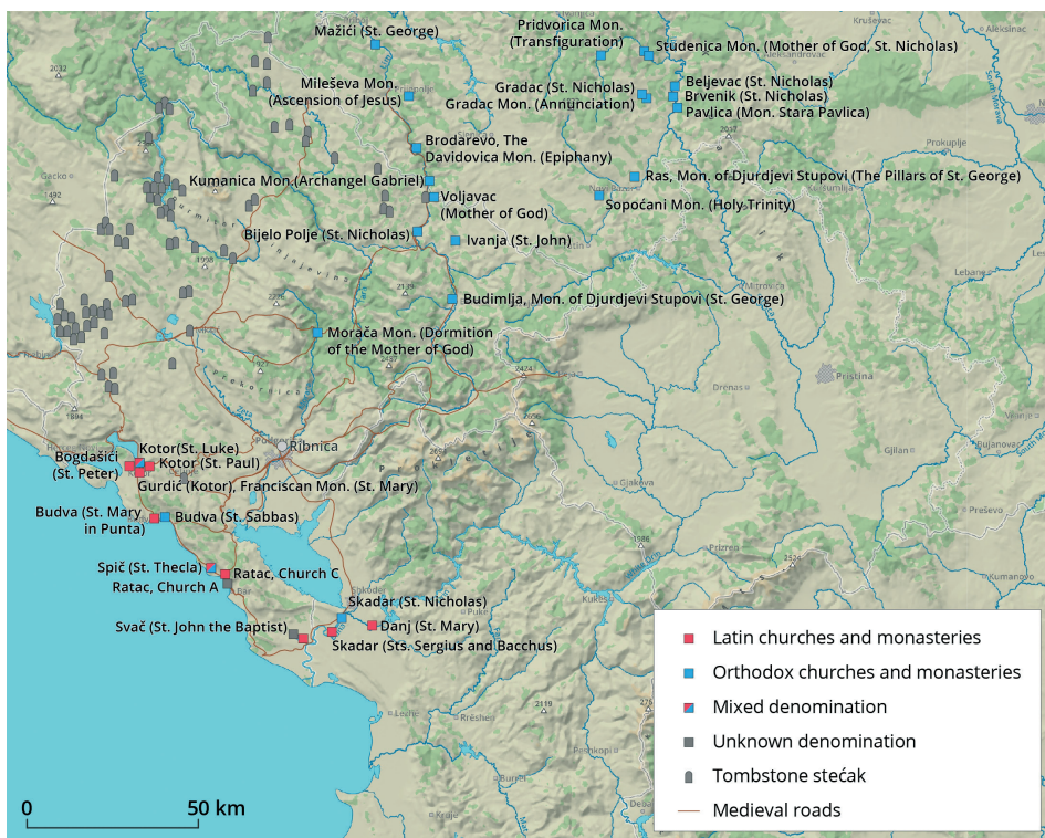
Fig. 2 The Denominations of the Monuments in the Area of Research (Map: Markus Breier, Data: Elisabeth Beer; Maps of Power OpenAtlas Database)

Regarding the funeral monuments ( stećci ), we used the publication by Šefik Bešliagić in order to embed his data in our database and to enrich with it our distribution map for further analysis and discussion. One of the challenges lies in the fact that the respective stećci in Montenegro are mostly undated.