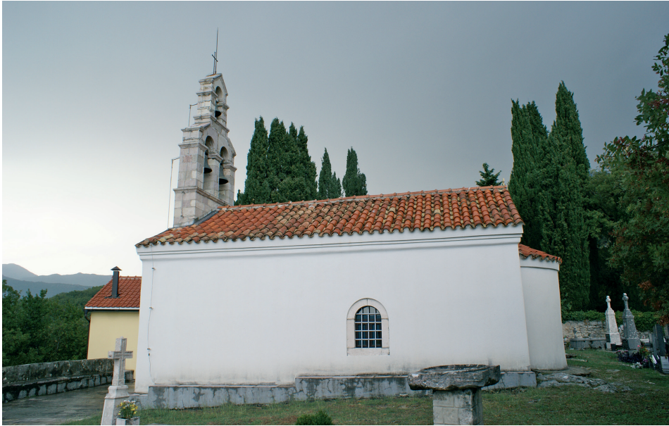
Fig. 3 The Church of St. Stephen in Sušćeapan (Mihailo St. Popović, 2021)